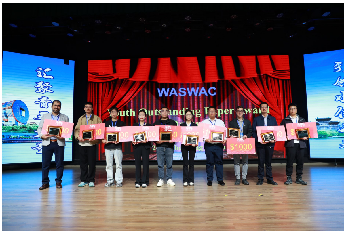
Group photo of WASWAC Youth Outstanding Paper Award (DATUM) 2024 winners