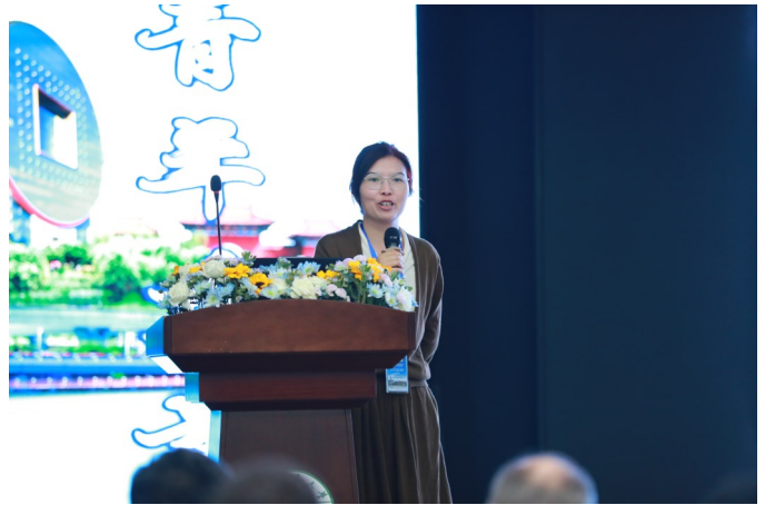
The chair persons of keynote reports