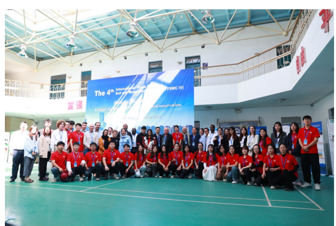
The happy hours