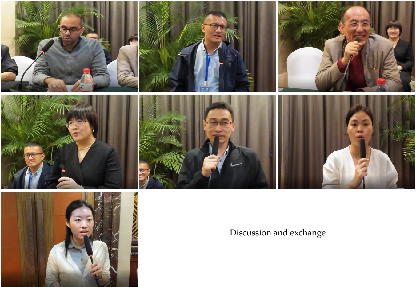
Discussion and exchange

All participants expressed their acknowledgement to the progress achieved recently through the efforts of all councilors especially the secretariat.