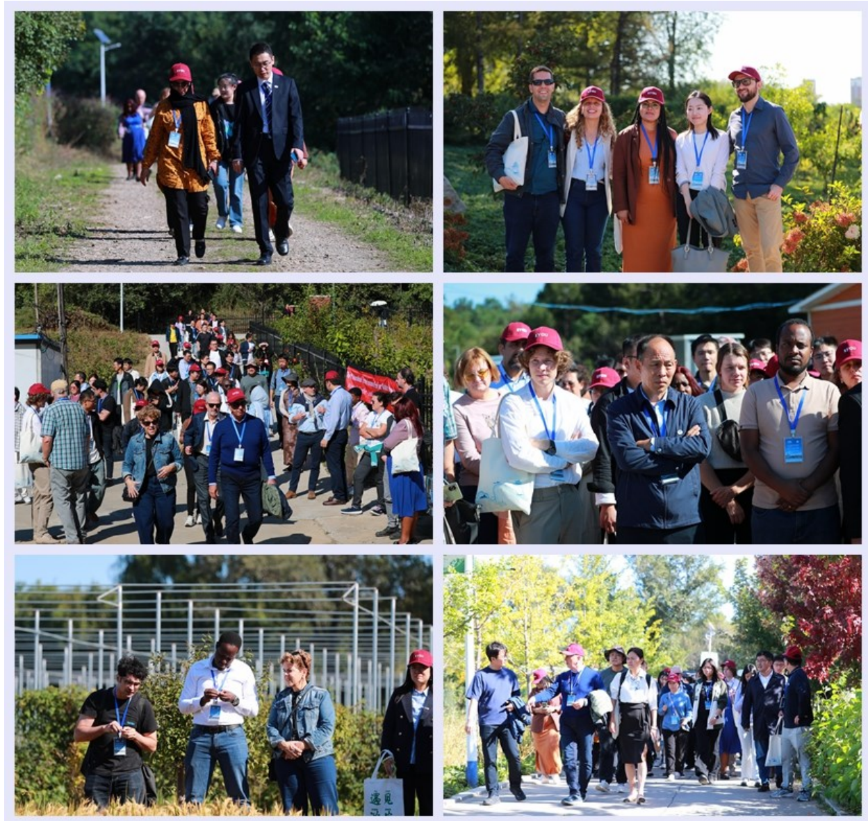
Field survey in soil erosion control

International Youth Forum on Soil and Water Conservation is initiated and sponsored by WASWAC. It is a global academic exchange activity designed for the young generations, which is held once every three years, and has become a valuable platform in ideas exchanging, knowledge sharing, and solutions providing.