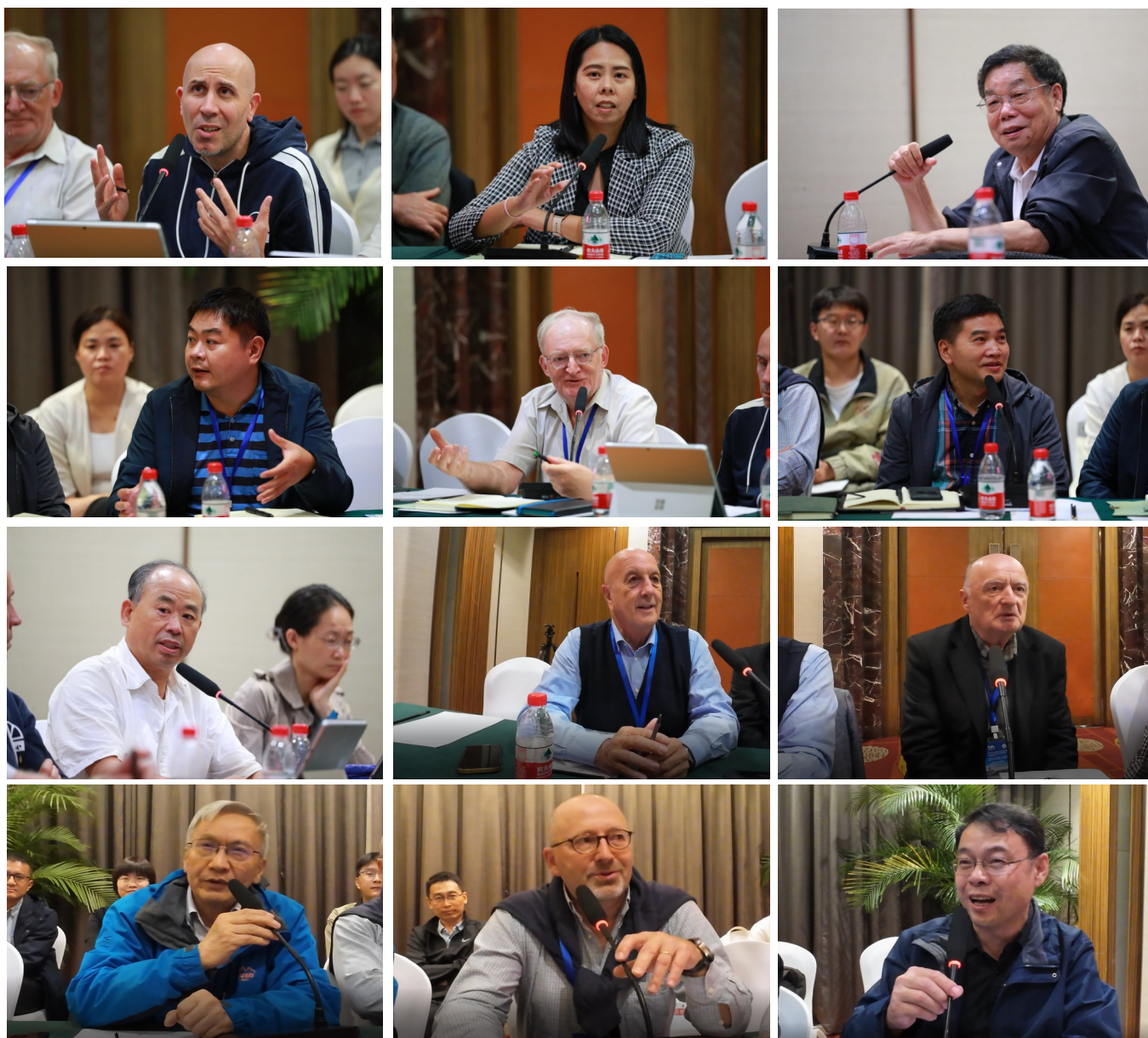
Discussion and exchange