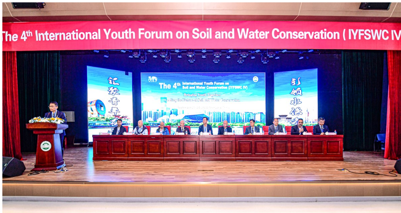
The Opening Ceremony

In order to promote the sustainable development of global scientific research in the field of soil and water conservation, and promote international exchange and cooperation of young scholars, following the previous 3 sessions held in Nanchang of China in 2015, in Moscow of Russia in 2018, and in Noor of Iran in 2021, the 4th International Youth Forum on Soil and Water Conservation was held in Shenyang successfully during September 21-24, 2024.