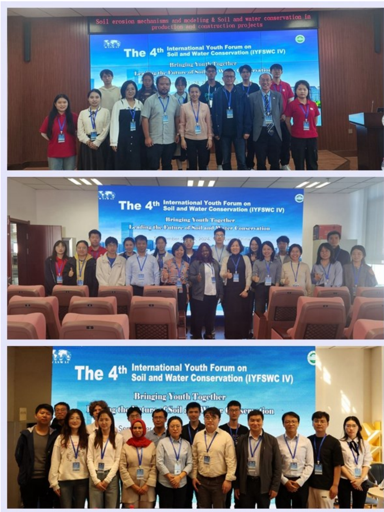
Group photo for each sub-topic meeting room

sinks for soil and water conservation, soil and water conservation biodiversity, soil and Water Conservation Policy, education and Popularization of Science.