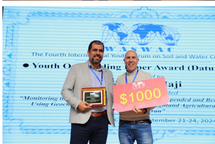
Award issue ceremony