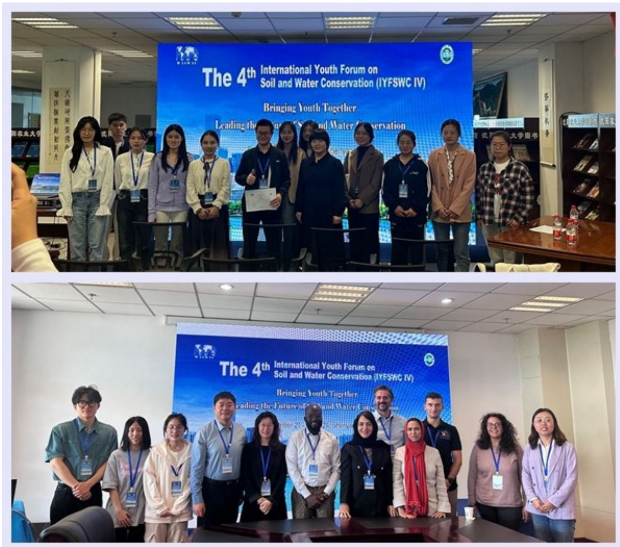
Group photo for each sub-topic meeting room

During the forum, an award ceremony for Outstanding Youth Paper was held, in which medals and honorariums were awarded to the first authors of evaluated 10 outstanding papers from China, Spain, Italy, and Iran. Tightly following this ceremony, the Youth Scientist Enlightenment Session was held, in which international experts were invited to comment and discuss the reports of the eight winners of the Outstanding Youth Papers, which broadened the research ideas of the young scientists.