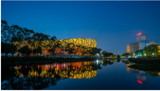
Bird's Nest (National Stadium)