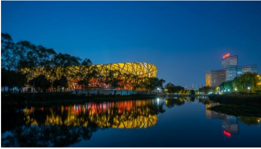
Bird's Nest (National Stadium)