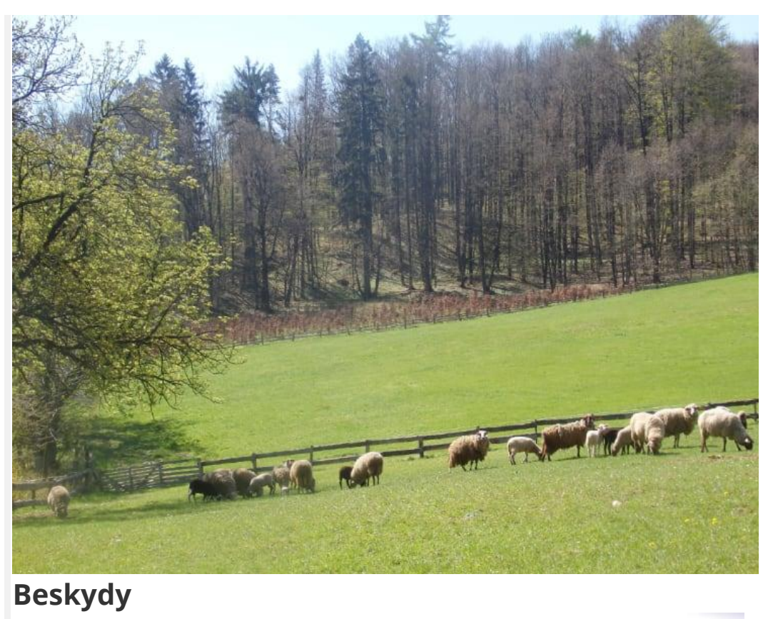
Konice and Bouzov upland area