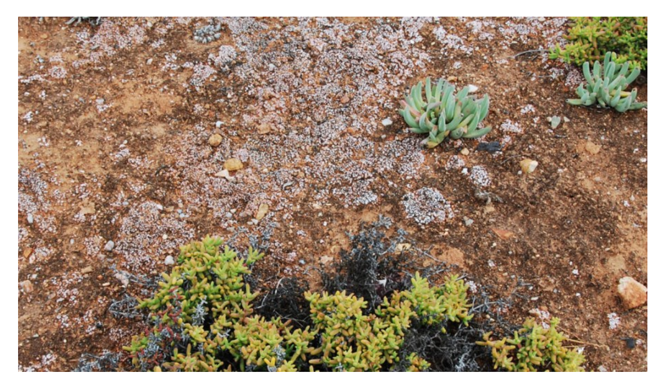
Lichens (whitish-pink) and cyanobacteria (dark brown to blackish) form biological soil crusts that carpet the ground between succulent plants and shrubs in the Succulent Karoo ecoregion in South Africa.

In the unceasing battle against dust, humans possess a deep arsenal of weaponry, from microfiber cloths to feather dusters to vacuum cleaners. But new research suggests that none of that technology can compare to nature's secret weapon — biological soil crusts.