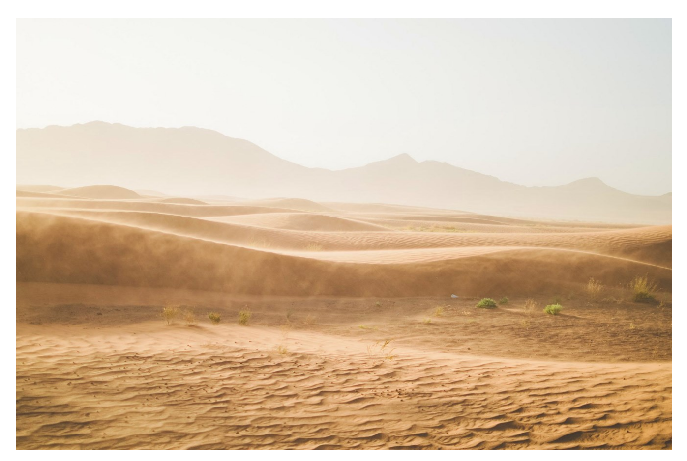
Louge et al. show how water vapor penetrates powders and grains.

sert surfaces exchange less moisture with the atmosphere than expected, and that water evaporation from individual sand grains behaves like a slow chemical reaction.