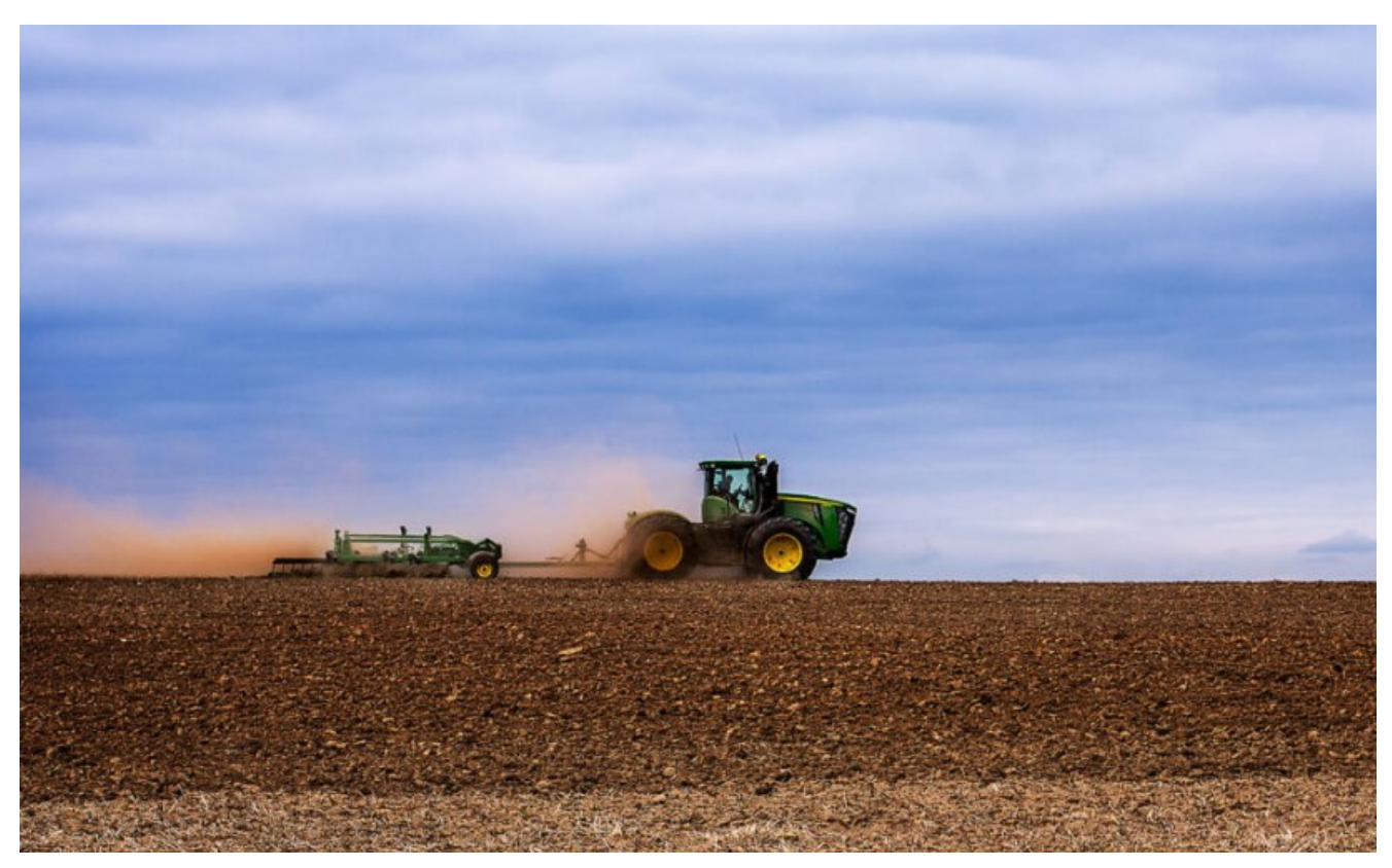
Tilling farmland is a key contributor to erosion and has played a role in the loss of billions of tons of soil in the U.S. Midwest, a new study finds.

With soils rich for cultivation, most land in the Midwestern United States has been converted from tallgrass prairie to agricultural fields. Less than 0.1 percent of the original prairie remains.