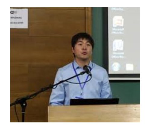
Wang Bin (China), President of International Youth Forum of Soil and Water Conservation

WASWAC members, and especially WASWAC officers have been gathered in the main mission and main WASWAC role: to work through the different ways on protection of the great natural resources such as water and soils. In this respect, in the period of coming time, I see WASWAC role through the gathering us in some global project of soil and water management for sustainability. It is desirable for this initiative to involve as many young people as possible. A key role in this regard would be the activity of IYFSWC - the International Youth Forum of WASWAC.