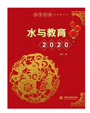
World Association of Soil and Water Conservation