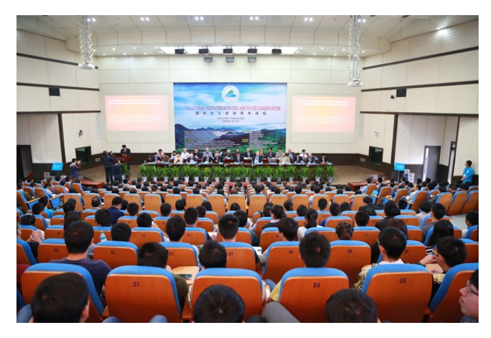
International Youth Forum of Soil and Water Conservation

WASWAC and CSSWC have similar background and academic interest. WASWAC was established in USA in 1983, and was moved to International Research and Training Center on