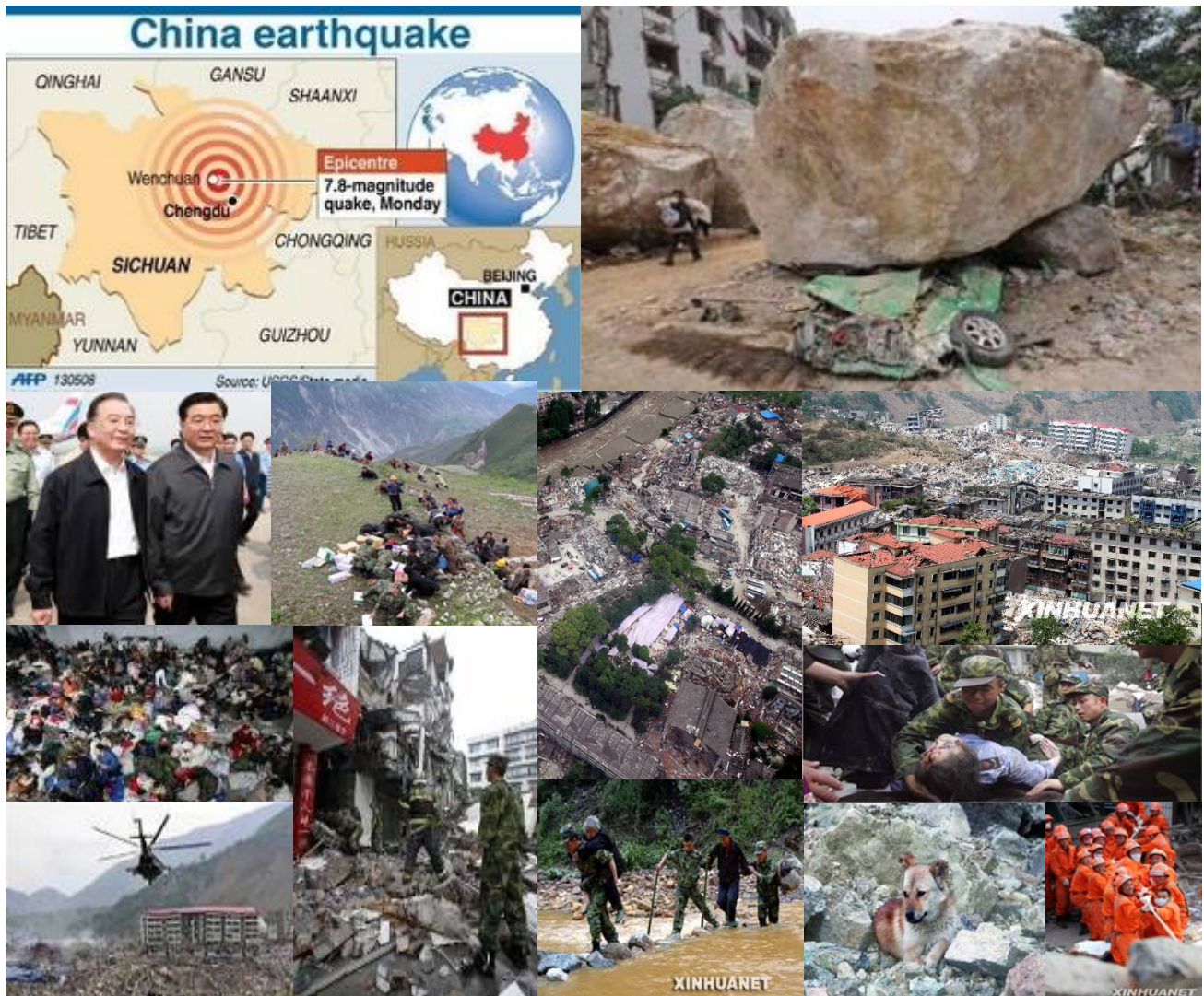
PHOTOS FROM THE 8.0 RICHTER EARTHQUAKE IN SICHUAN, CHINA, MAY 12, 2008

See more in our Webshots album http://good-times.webshots.com/album/563415340XFMpLN