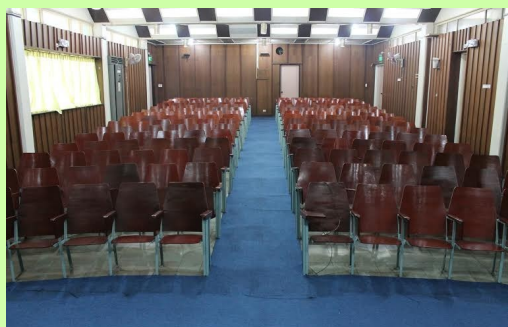
2. AVR—Lecture Hall for the plenary paper presentations