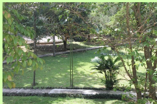
3. Exhibit area for sponsors