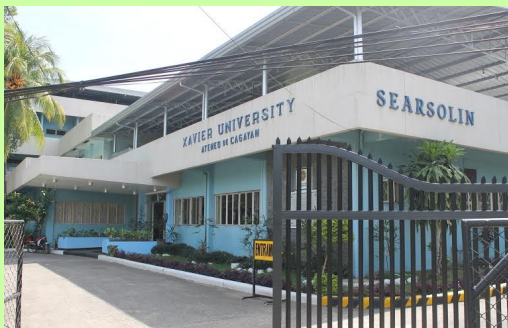
1. The venue of the conference