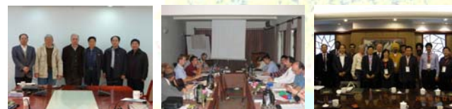
Conference pictures of WASWAC