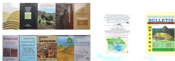
A series of WASWAC publications

WASWAC has published a series of books and issues the monthly Hot News and quarterly BULLETIN, reporting the latest news about relevant issues such as research funding, scholarships and fellowships, opportunities for training and study tour, new books, proceedings, magazines, brochures, newsletters, call for papers, conferences and worldwide job opportunities.