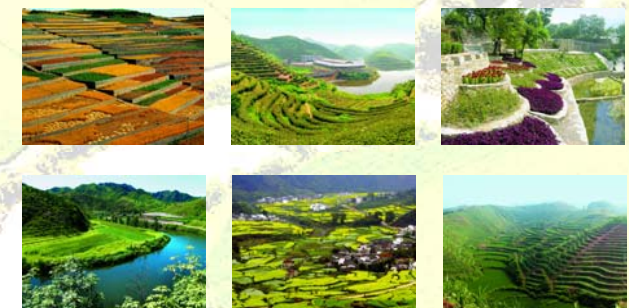
Soil and water conservation treatments